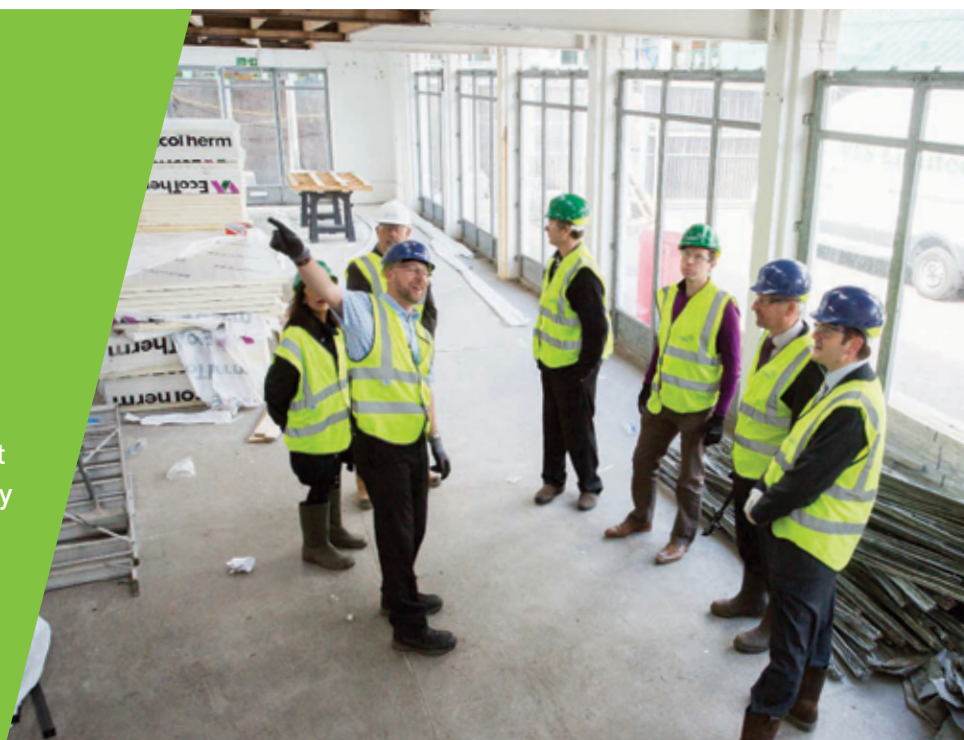
On site... construction and council representatives at Sneinton Market