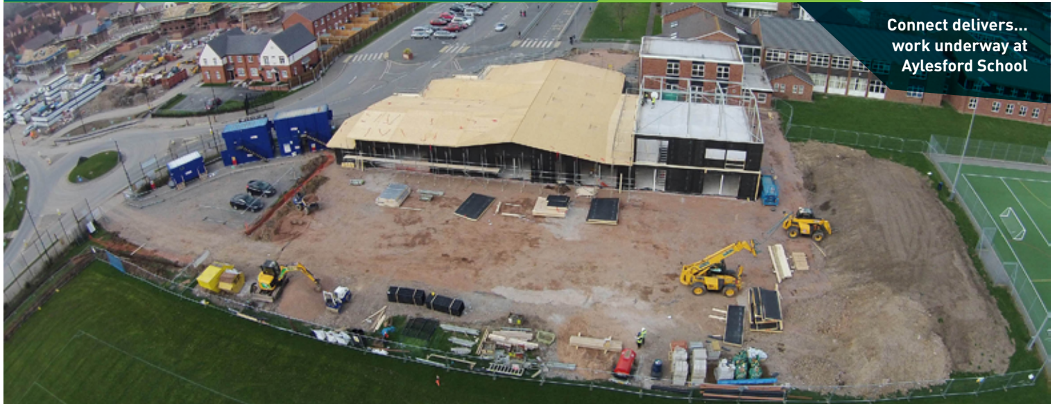
Connect delivers... work underway at Aylesford School