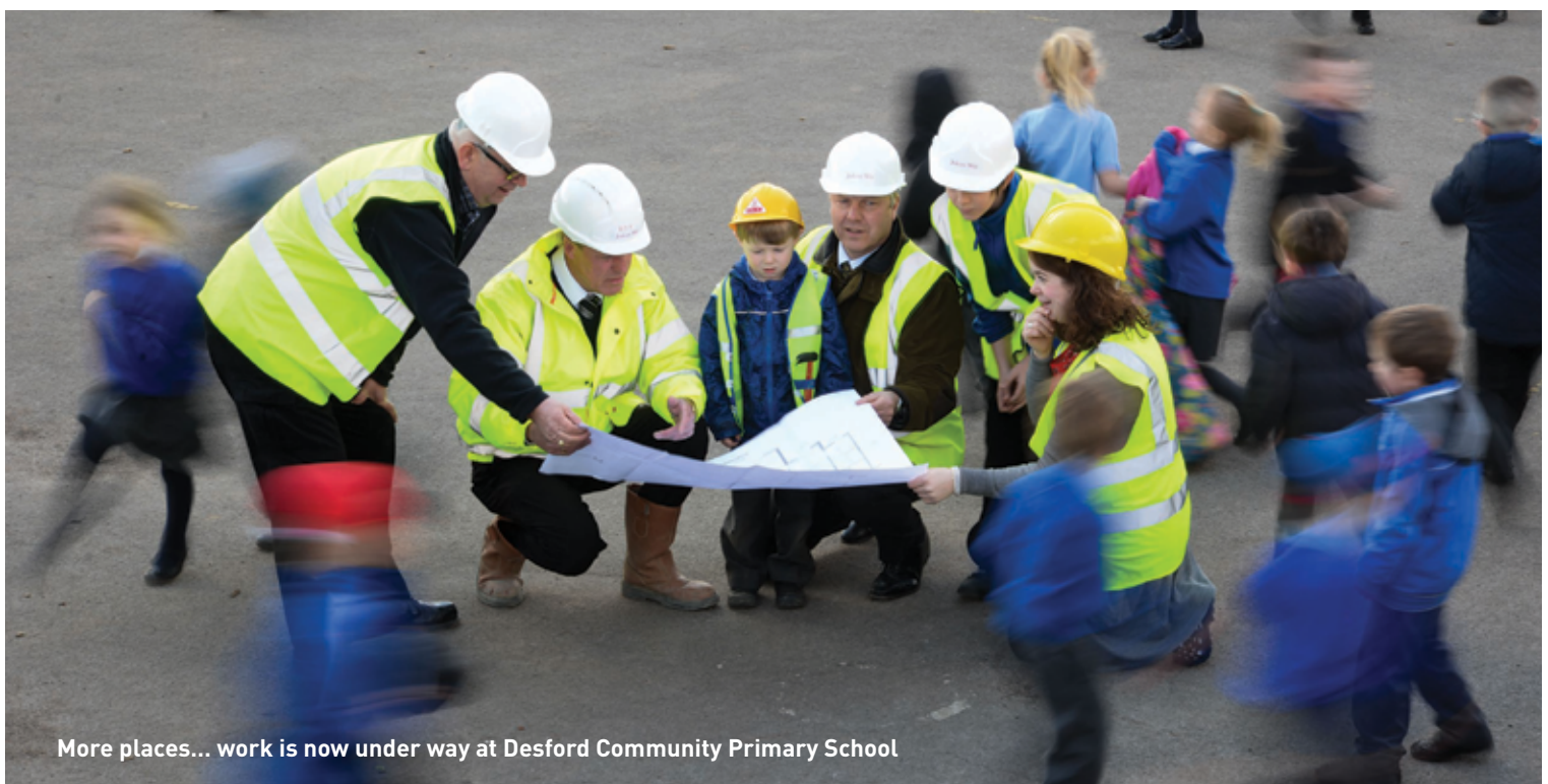
More places... work is now under way at Desford Community Primary School