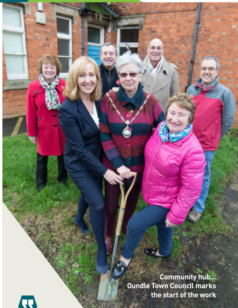
Community hub... Oundle Town Council marks the start of the work

Externally, roof repairs will be carried out and the existing windows replaced and new car parking provided.